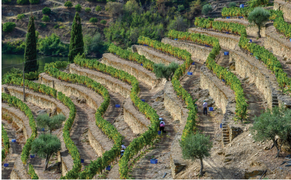
THE 'PORT ARTHUR' STONE TERRACES AT QUINTA DOS MALVEDOS

been abandoned in the aftermath of phylloxera, were reconstructed by hand, recovering the sturdy retaining walls to create terraces, with minimal disturbance of the schist bedrock. A vine planted under these conditions is naturally stressed, having to put down deep roots through cracks in the schist to find the necessary water with which to survive the typically hot and dry summer of the Douro.