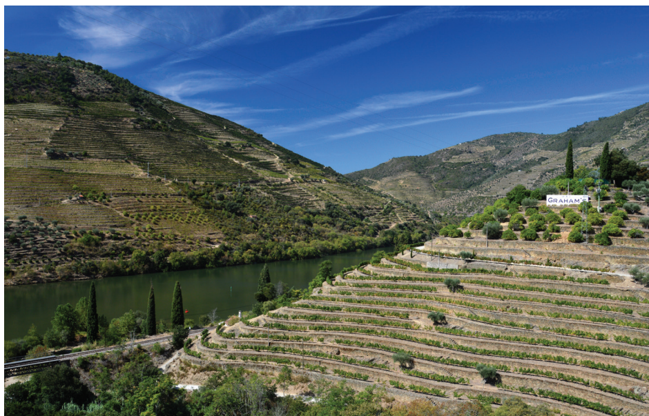
THE PORT ARTHUR VINEYARDS CATCH THE MORNING SUN