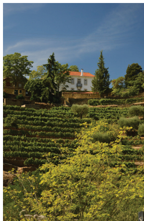
VINHA DOS CARDENHOS

This Stone Terraces release represents less than 2% of the production of the Quinta dos Malvedos estate in 2016.