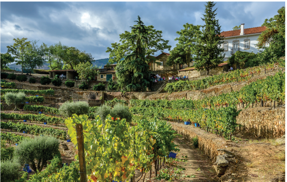
THE AMPHITHEATRE-SHAPED VINHA DOS CARDENHOS STONE TERRACES AT MALVEDOS

The pickers started on the northeast oriented Cardenhos section of the stone terraces, a diminutive (0.6 ha) amphitheatre-shaped vineyard behind the Quinta house, and gradually worked their way around the ridge on which the latter is built to harvest the 1.2 ha 'Port Arthur' vineyard, whose 1,379 vines face due east. While 'Port Arthur' produced concentrated wines of impressive structure, reflecting its greater exposure to sunlight, Cardenhos delivered delicate, balanced wines with wonderful finesse. Touriga Nacional is the predominant