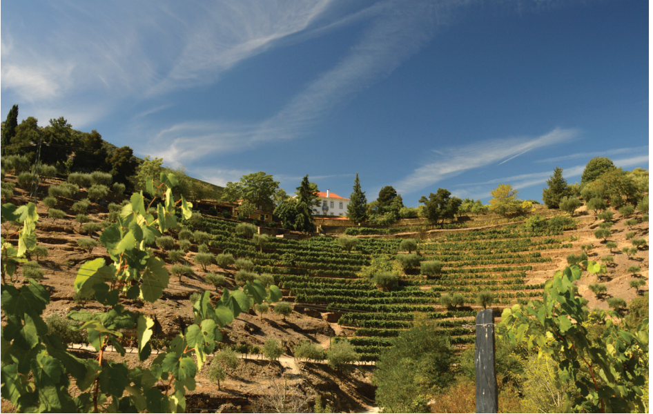
THE VINHA DOS CARDENHOS, ONE OF THE STONE TERRACES VINEYARDS AT MALVEDOS