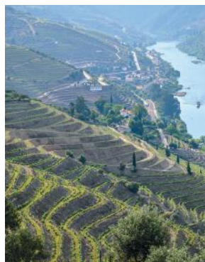
QUINTA DOS MALVEDOS

As a result of the adjustments to the picking plan, each vineyard at Malvedos and Tua was picked at optimal ripeness. The Valdossa vineyard, high above the Malvedos estate house, produced superb grapes from its 30-year-old Touriga Nacional, their maturity delivering wines of