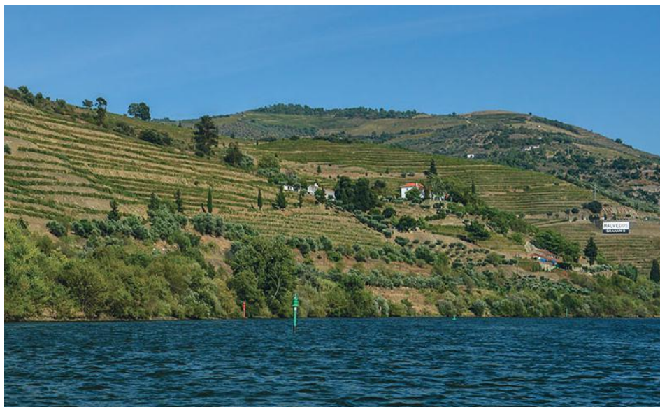
QUINTA DOS MALVEDOS: THE VINEYARD VIEWED FROM THE RIVER

Two quintas owned privately by members of the Symington family, Vila Velha and Vale de Malhadas, contributed small parcels of excellent quality grapes. At Vila Velha, the Vinha da Barca contributed its finest Touriga Nacional and Touriga Franca, which were co-fermented to capture the full expression of this west-facing riverside vineyard. At Vale de Malhadas, the production from the barely half a hectare sized Vinha dos Eucaliptos vineyard provided elegant floral aromas from Touriga Franca grapes.