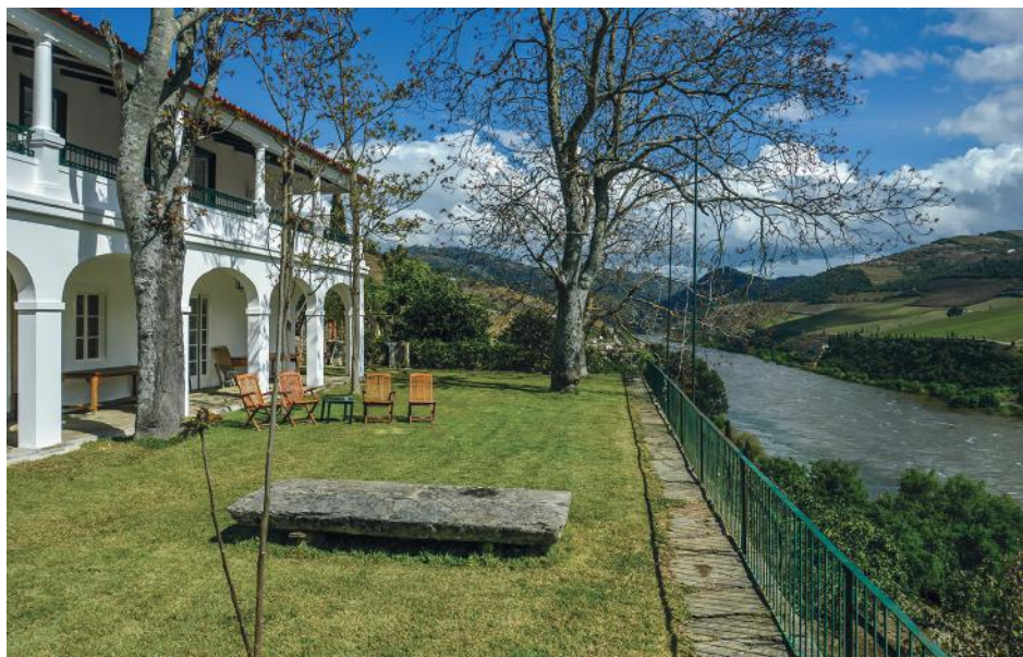
QUINTA DOS MALVEDOS, MARCH 2016: THE RIVER DOURO, SWOLLEN BY THE ABUNDANT WINTER RAINFALL