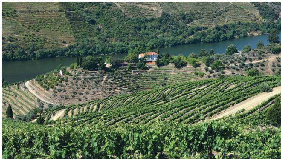
QUINTA DOS MALVEDOS: THE VALDOZZA VINEYARD IN THE FOREGROUND

The small volumes of this Graham's 2016 Vintage bottling consist of 6,325 cases, including 600 magnums, and 352 Tappit Hens. The Symington family derive great confidence from the promise that this beautifully crafted wine holds for the future.