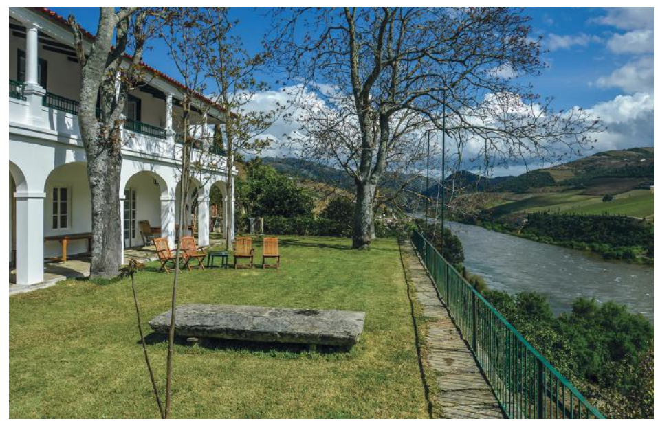
QUINTA DOS MALVEDOS, MARCH 2016: THE RIVER DOURO, SWOLLEN BY THE ABUNDANT WINTER RAINFALL