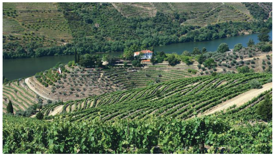
QUINTA DOS MALVEDOS: THE VALDOSSA VINEYARD IN THE FOREGROUND

The small volumes of this Graham's 2016 Vintage bottling consist of 6,325 cases, including 600 magnums, and 352 Tappit Hens. The Symington family derive great confidence from the promise that this beautifully crafted wine holds for the future.