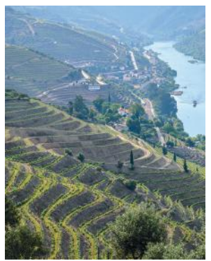
QUINTA DOS MALVEDOS

As a result of the adjustments to the picking plan, each vineyard at Malvedos and Tua was picked at optimal ripeness. The Valdossa vineyard, high above the Malvedos estate house, produced superb grapes from its 30-year-old Touriga Nacional, their maturity delivering wines of