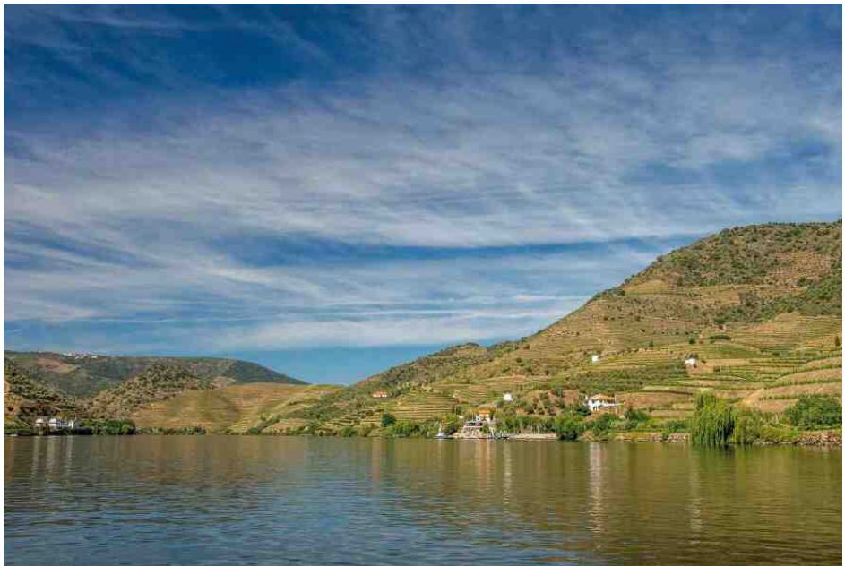
THE 'VINHA GRANDE' VINEYARDS (TOP RIGHT) AT SENHORA DA RIBEIRA

For over a century the Dow's Vintages have been blended primarily from two properties, Quinta do Bomfim, near