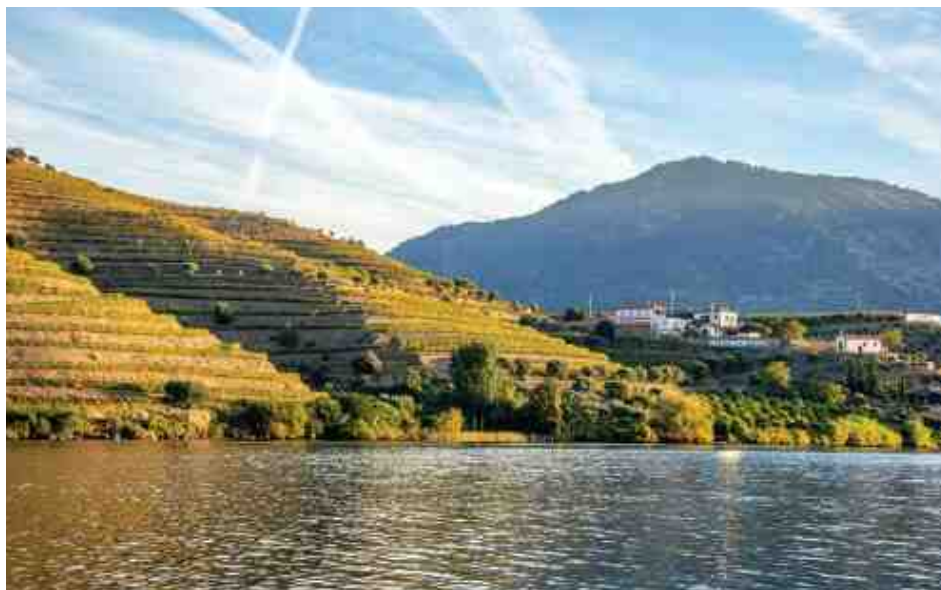
QUINTA DA SENHORA DA RIBEIRA