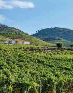
QUINTA DO BOMFIM

Pinhão, and Quinta da Senhora da Ribeira in the Douro Superior. These two vineyards consistently produce some of the finest wines when the climatic conditions are favourable. Their grapes are amongst the best that the Douro can produce. In recent years, two other properties — Quinta da Cerdeira and Quinta do Cabeço — both of which are a few kilometres from Senhora da Ribeira, have made important contributions to the blend. Cerdeira is a south-facing vineyard enjoying good exposure through the growing and ripening cycles during the summer, providing for well-ripened grapes that produce intense, well-structured wines. The Cabeço has a range of exposures to the sun giving an interesting selection of wines.