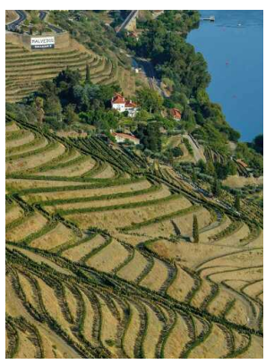
QUINTA DOS MALVEDOS

The reason why back-to-back declarations have been so rare is that in the Port trade we have always had the luxury of comparing the attributes of the best wines from two consecutive years prior to committing to bottling the older one as a classic Vintage Port, typically at nineteen months of age. Normally one or other year stands out, making for a relatively easy choice. In the case of 2016 and 2017, we were faced with a true dilemma, with both years demonstrating outstanding quality and clear potential for ageing, albeit with very different characteristics. After many tastings and much debate over the relative qualities of the two Vintages and given the extremely positive evolution of the 2017 wines following the bottling of the 2016 in 2018, our family decided that