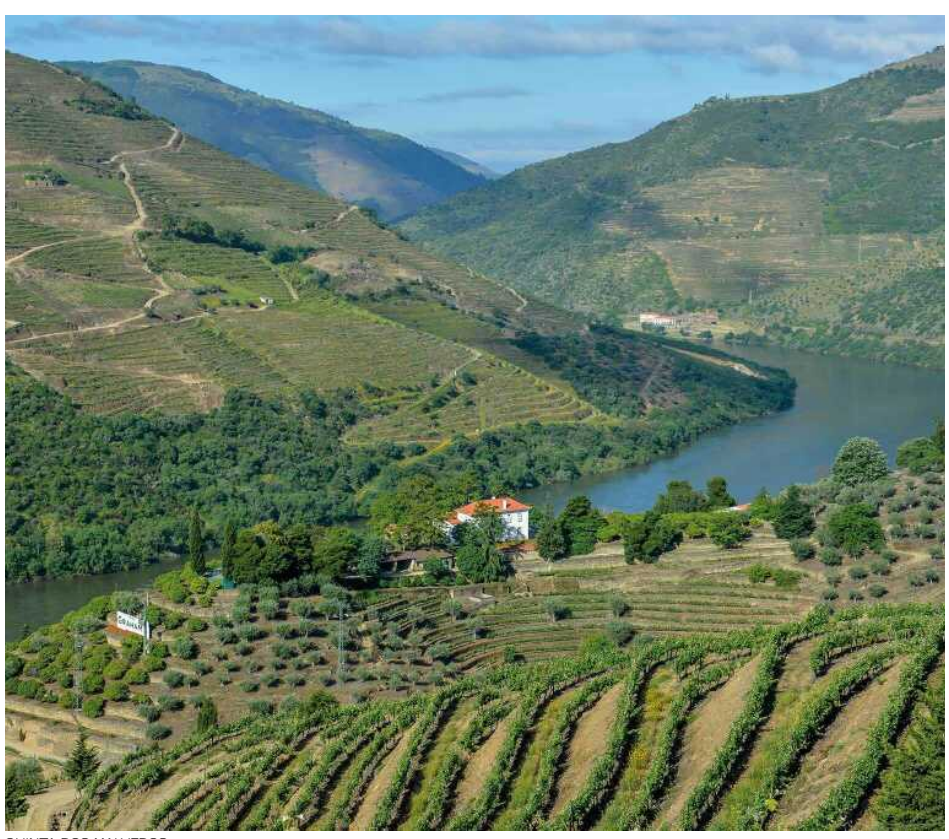
QUINTA DOS MALVEDOS

It would be easy to devote much of this page to providing a comparison of the style of the two years. We believe, however, that we should concentrate on describing the qualities of the Vintage in question, and in particular drawing attention to the exceptionally small bottling quantity of Graham's 2017 Vintage Port. It is worth recalling that a total of only 5,250 nine-litre cases (all formats) of wine have been bottled, which represents just 11% of what was produced in Graham's vineyards that year.