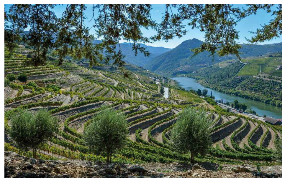
QUINTA DO TUA