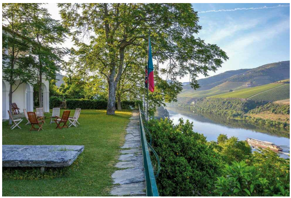
THE GARDEN TERRACE, QUINTA DOS MALVEDOS